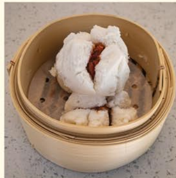
Char Siew Bun (3pcs) Steamed BBQ Pork Bun $5.90