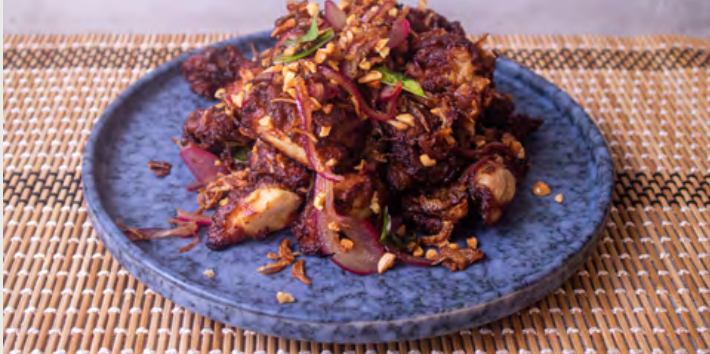
Deep Fried Tom Yum Chicken