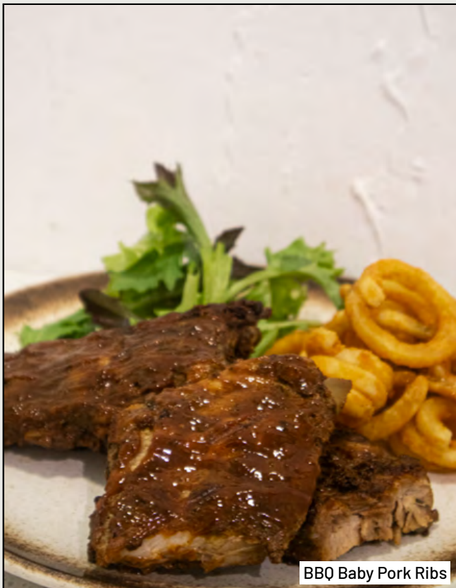
BBQ Baby Pork Ribs