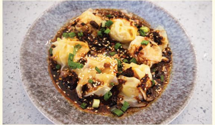
Wonton with Chili Oil (6pcs) Boiled Shrimp Dumpling with House-made Chili Oil $7.20

Cabbage, Pork $6.90 Prawn, Pork, Chive $6.90 Chive, Egg 🌱 $5.90