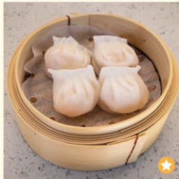
Har Gaw (4pcs) ★ Steamed Prawn Dumpling $6.20