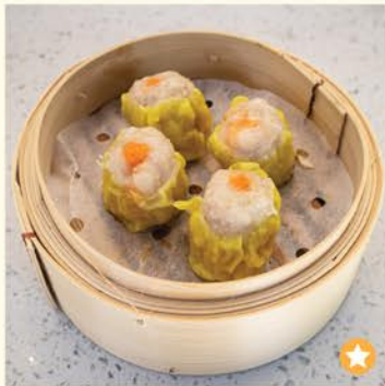
Steamed Siew Mai (4pcs) ★ Steamed Pork Dumpling with Shrimp $5.80