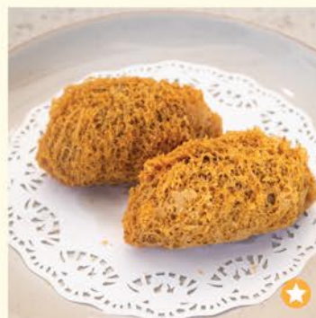
Crispy Yam Puff (2pcs) ★ Deep Fried Yam Puff with BBQ Pork $4.90