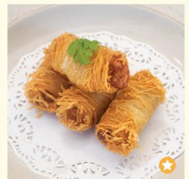
Golden Seafood Roll (4pcs) ★ Deep Fried Vermicelli Roll with Shrimp $6.00