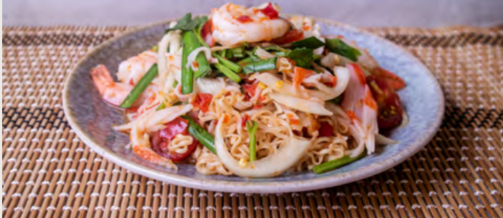
Spicy Mama Noodle Salad