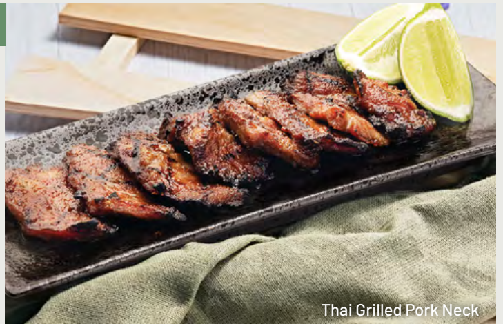
Thai Grilled Pork Neck