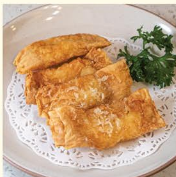
Crispy Beancurd Skin Roll with Prawn (4pcs) $5.90