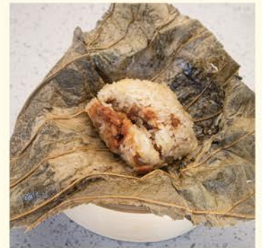
Lotus Leaf Rice (2pcs) Steamed Glutinous Rice in Lotus Leaf $5.90