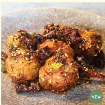
Mala Fried Siew Mai (6pcs) NEW $7.90