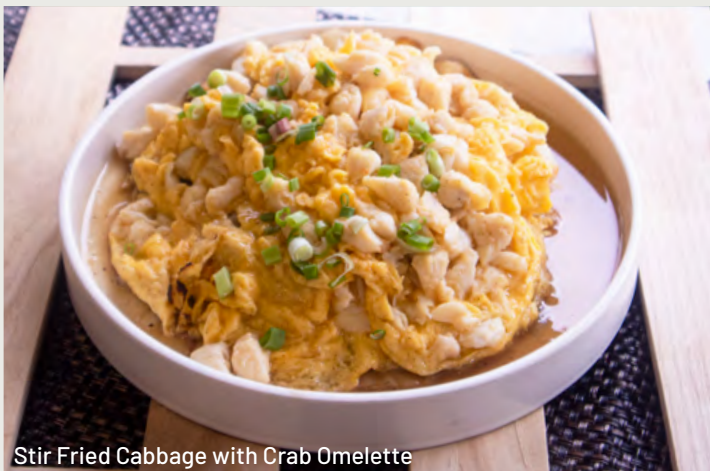
Stir Fried Cabbage with Crab Omelette