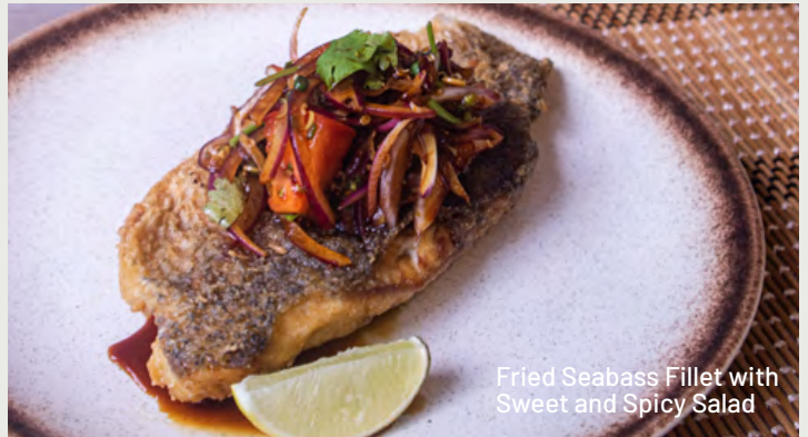
Fried Seabass Fillet with Sweet and Spicy Salad