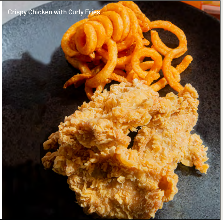
Crispy Chicken with Curly Fries

Honey Sesame Chicken $9.90 Mid Wings (6-piece)