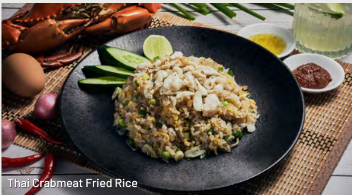
Thai Crabmeat Fried Rice