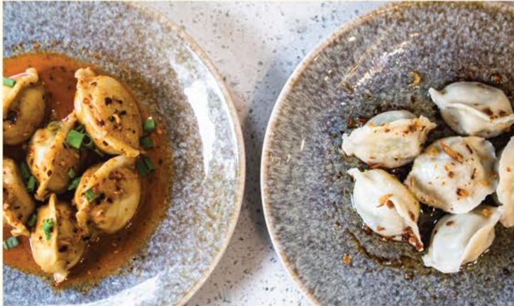
Boiled Peking Dumpling (6pcs) NEW 🔥 with Shallot Oil, Spicy Sesame Sauce or Plain

Cabbage, Pork $6.90 Prawn, Pork, Chive $6.90 Chive, Egg 🌱 $5.90