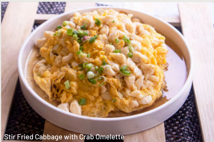
Stir Fried Cabbage with Crab Omelette