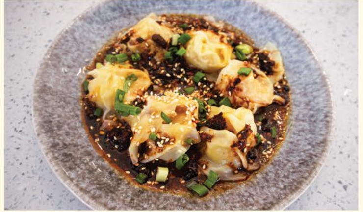
Wanton with Chili Oil (6pcs) Boiled Shrimp Dumpling with House-made Chili Oil $7.20